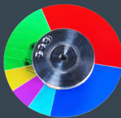
Top: Electron microscope image of a DMD chip showing the micromirrors in comparison to the tip of a pin. Above: RGBCMY 'Brilliant Colour' colour wheel from a single chip projector.